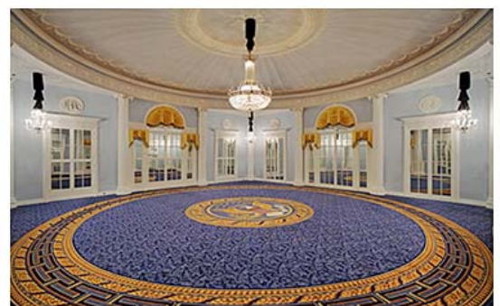
Gerald R. and Betty Ford Presidential Ballroom